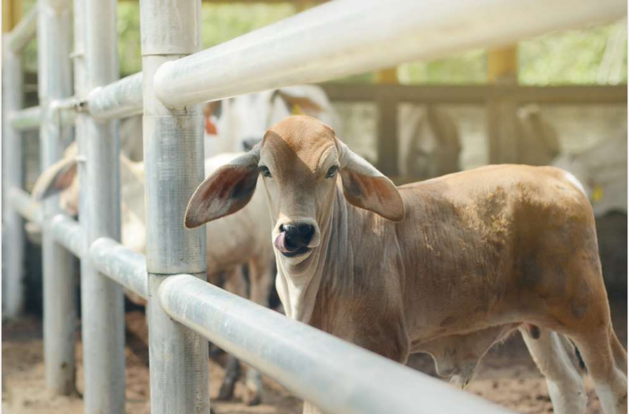
A calf at KPT MS, Lampung