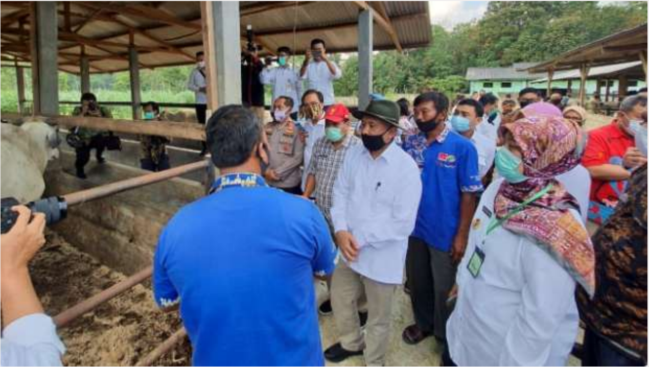
Minister UMKM, Teten Masduki, in discussion with KPT-MS members