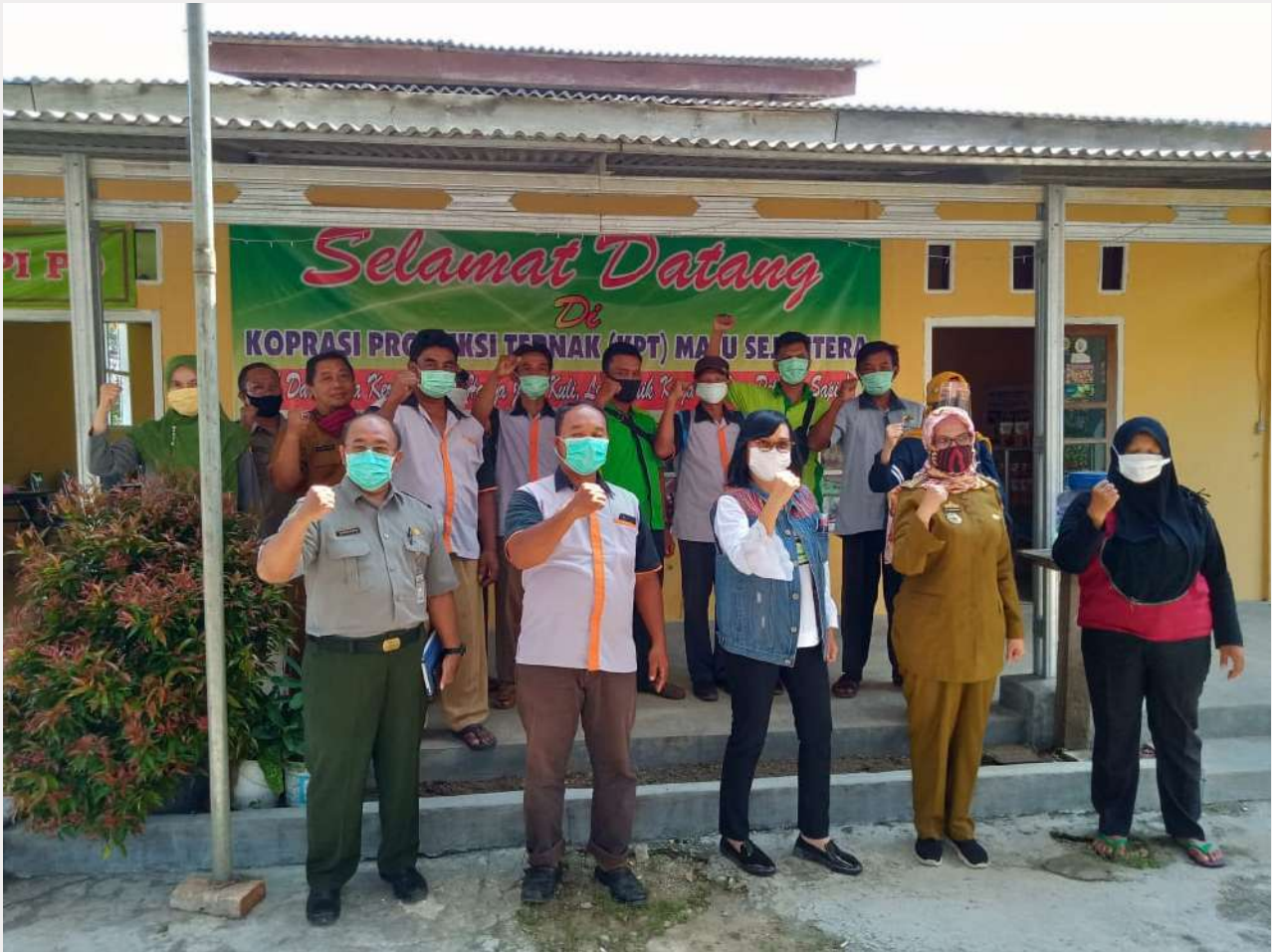
Director Processing and Marketing in DG Livestock MoA visiting KPT-MS

bred cattle and some investment support to start the program. IACCB has been supporting KPT-MS through financial modelling and addressing technical issues to prepare for implementation.