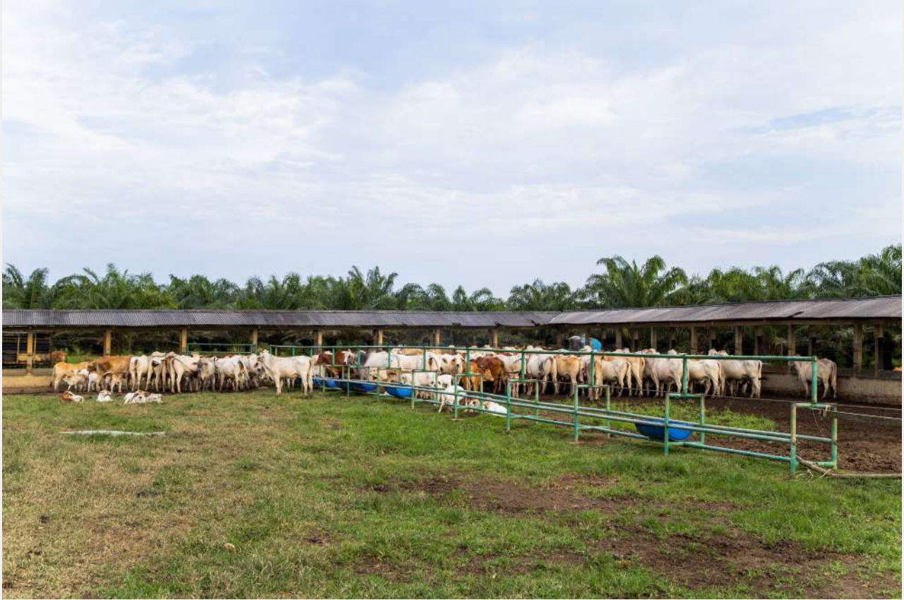
Cattle at PT KAL's facility in Central Kalimantan