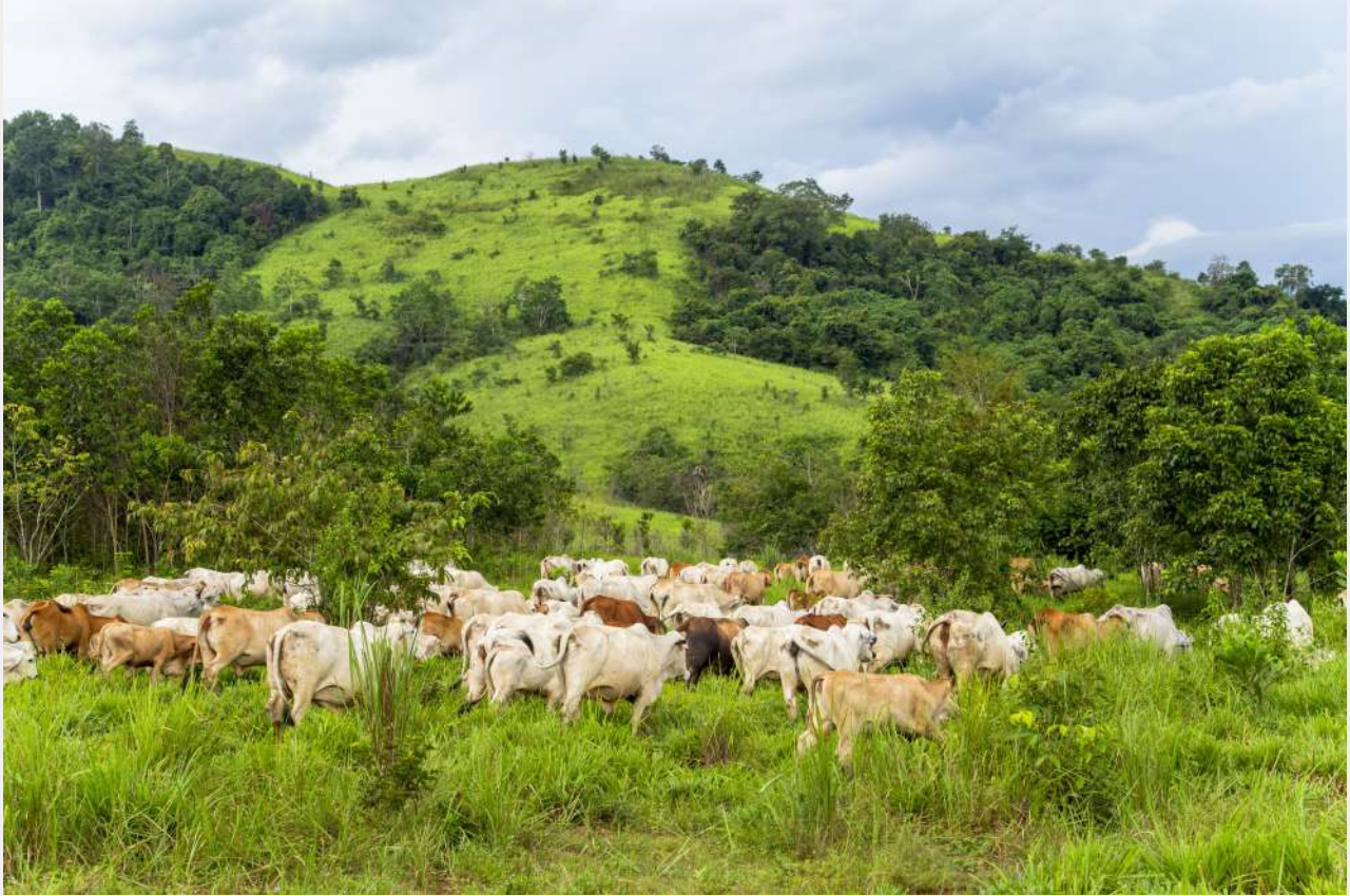
Cattle Grazing in PT CAP in South Kalimantan